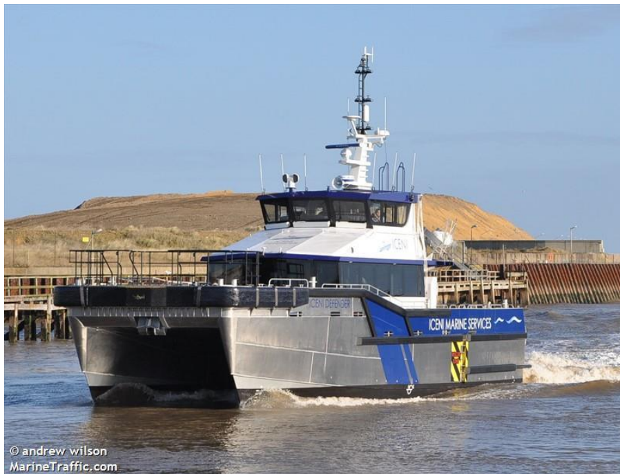
Icenii Defender - MAND2

The vessel can be contacted on VHF Channel 16 throughout for any further information.